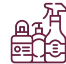
Cleaning Chemical and Equipment Manufacturers and Distributors*