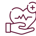
Healthcare and Infection Control Professionals