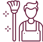
Senior Housekeeping Professionals of Hotels