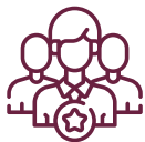
Industry Consultants and Experts