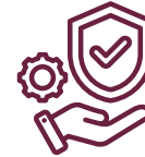
Soft FM Service Providers